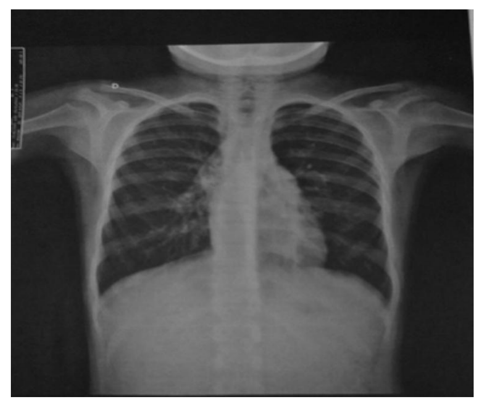
Fig. II - Chest radiography: dextrocardia.