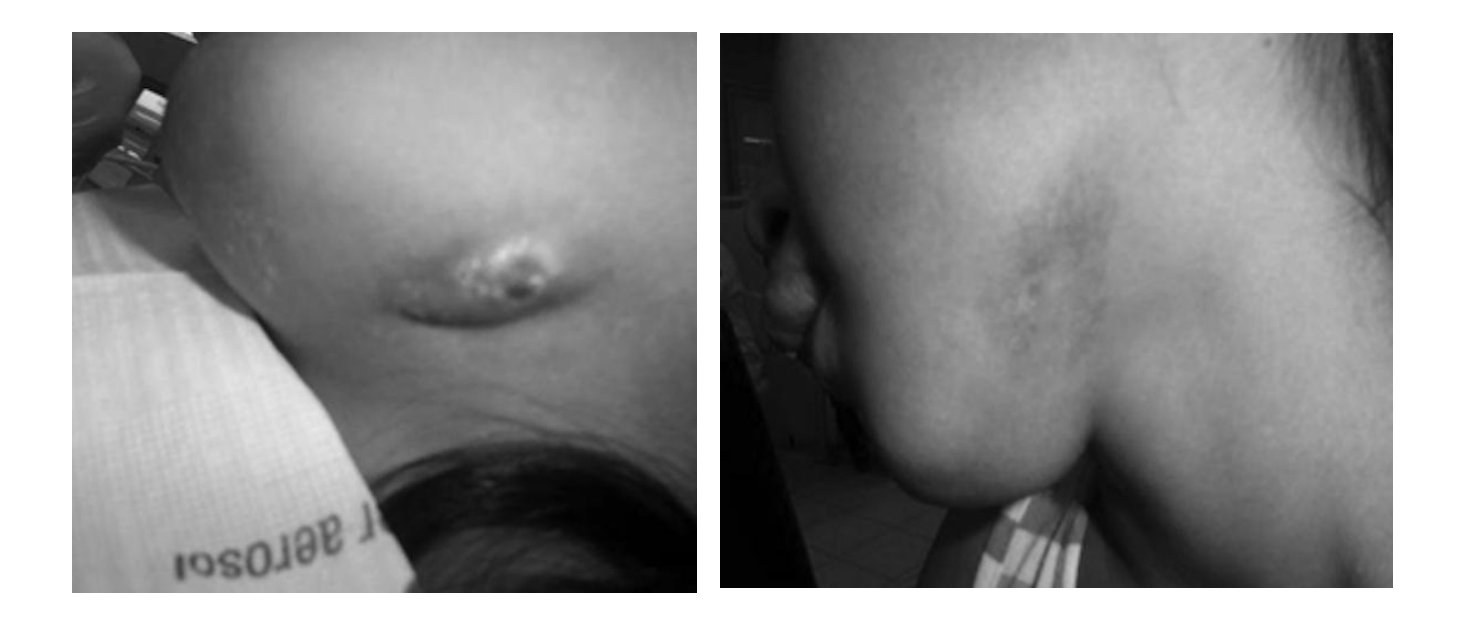
Fig. V - Fistula lesion 1 and 3 weeks after exodontia of 36.

© Associated Asia Research Foundation (AARF) A Monthly Double-Blind Peer Reviewed Refereed Open Access International e-Journal - Included in the International Serial Directories.