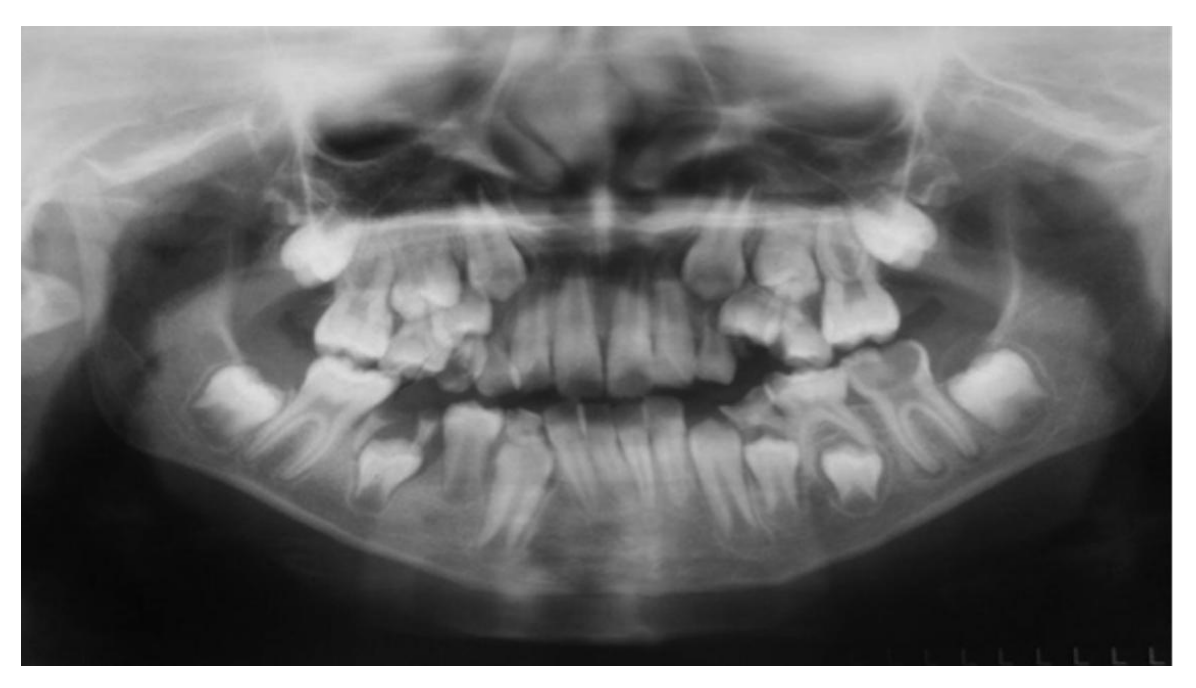
Fig. I - Panoramic radiography: tooth lesion 36.

oral medium with glass ionomer and then the removal of caries and composite resin restorations of teeth 16, 75, and 46; extraction of decayed tooth 54, condemned by decay, and of the residual roots of tooth 85. The progressive involution of the fistula lesion (Fig. V) was observed, but a deforming scar is still visible in view of the long duration of the fistula process and, with the removal of infectious foci showed a significant decrease in edema in the upper lip (Fig. VI). and in summary we can observe that eliminating the causes there was remission of the effects. Intraoral lip injections with corticosteroids were proposed for the treatment of the lip, but the family had an urgent need to return to Piauí, due to financial difficulty in staying out of the home, therefore, it was not possible to complete the treatment. The patient was treated with a physical therapist doing respiratory exercises, and followed up with psychology in that period, evidencing an expressive improvement in her self-esteem and in her communication, becoming more affable and with a great bond to the professionals who treated her. Continuous control of the patient's systemic and oral situation in Piauí was recommended. It was observed, therefore, that the fistula completely regressed and lip edema regressed significantly after treatment of the patient's dental condition and removal of the infectious focus represented by the fistula.