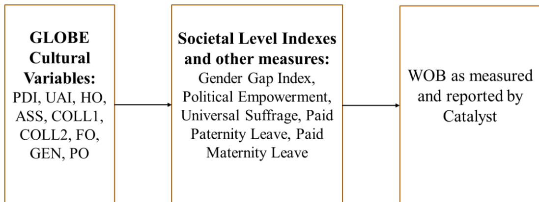
Figure 2. Proposed model

Based on the literature review we believed the model will be as shown in Figure 2. This model will be tested in the following section (data analysis); we will explore the relationships across various cultural factors (power distance, uncertainty avoidance, humane orientation, assertiveness, in-group collectivism, institutional collectivism, future orientation, gender egalitarianism, performance orientation) and societal level indexes and other measure (gender gap index, political empowerment, universal suffrage, paid paternity leave, paid maternity leave) and also test how they affect women on boards.