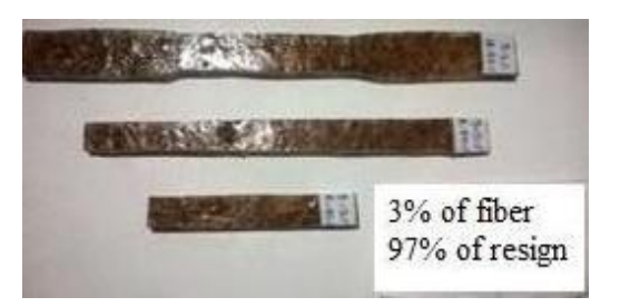
(d) Specimen at 3% of fiber 97% resin