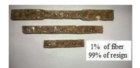
(b) Specimen at 1% fiber 99% resin