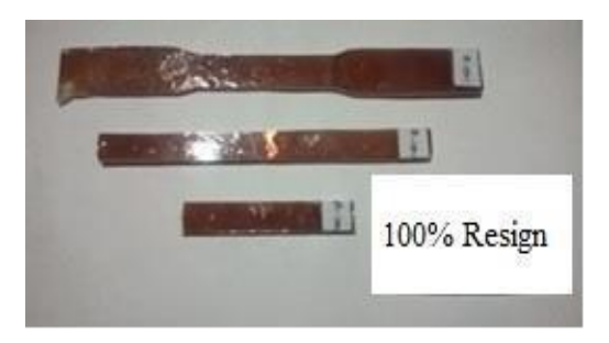
(a) Specimen at pure resin

that polyester mixture completely spread over the fibers. Before applying compression, efforts were made to remove all bubbles with roller. Finally, the compression pressure was applied evenly to achieve the uniform thickness of 3 mm and cured for 24 h at room temperature. The obtained composite plates are of the size (200 \times 150 \times 3) \text{ mm}^3 .