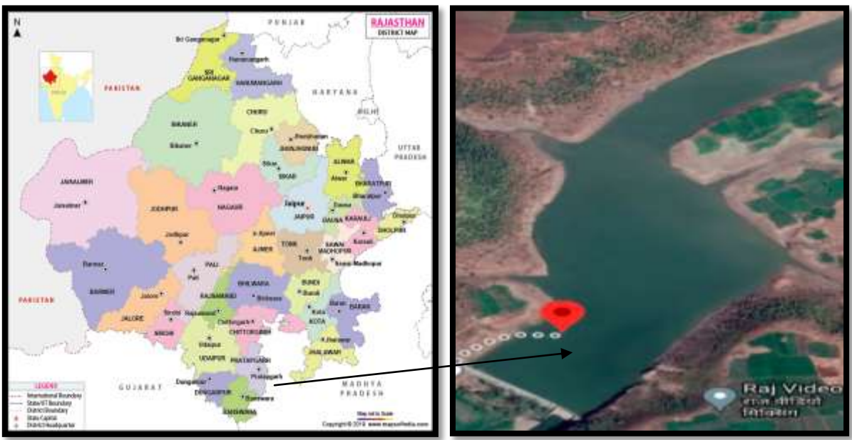
Fig.1: Location Map Bhanwar Semla Reservoir of District Pratapgarh.