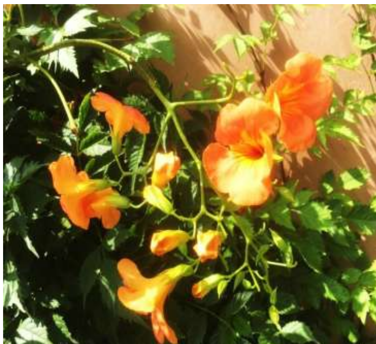
Plate 8: The images of beautiful pictures of the ChashmeShahi Mughal garden with purple colour.