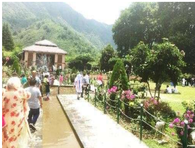
Plate 3: The attractive picture of the ChashmeShahi garden’s passages which leads to the main spring of the terraces with beauties of the inner garden to PariMohal.

Plate 2: The charming image of the Royal spring from where water of the spring is coming to the terrace.