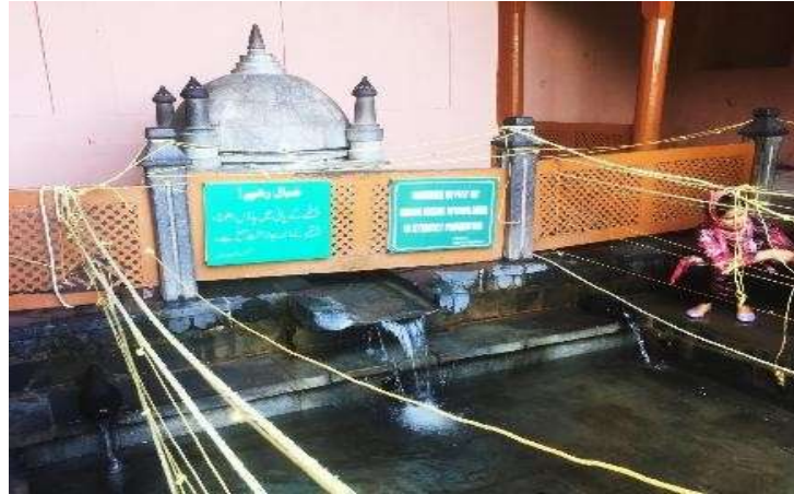
Plate 2: The charming image of the Royal spring from where water of the spring is coming to the terrace.

Plate1: The beautiful picture of the garden ChashmeShahi from the entrance of it which shows the entire beauties of the garden.