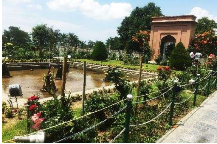
Plate 4: The picture of barricaded terrace of the ChshmeShahi Mughal garden with different types of attractive flowers and lights.