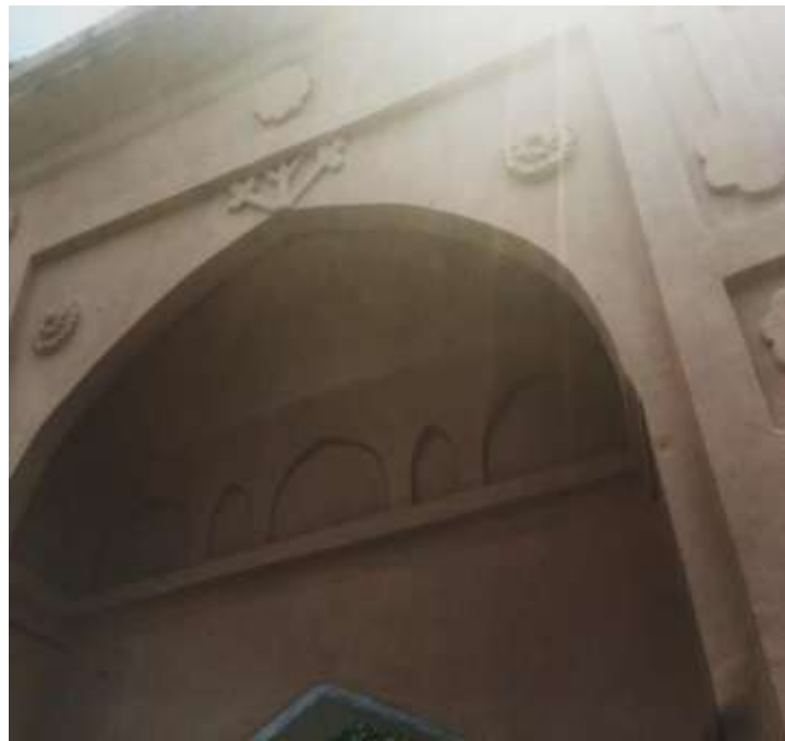
Plate 7: The beautiful picture of an outer portion of the garden ChashmeShahi with the design of Mughal architecture and with the influence of Iranian culture.