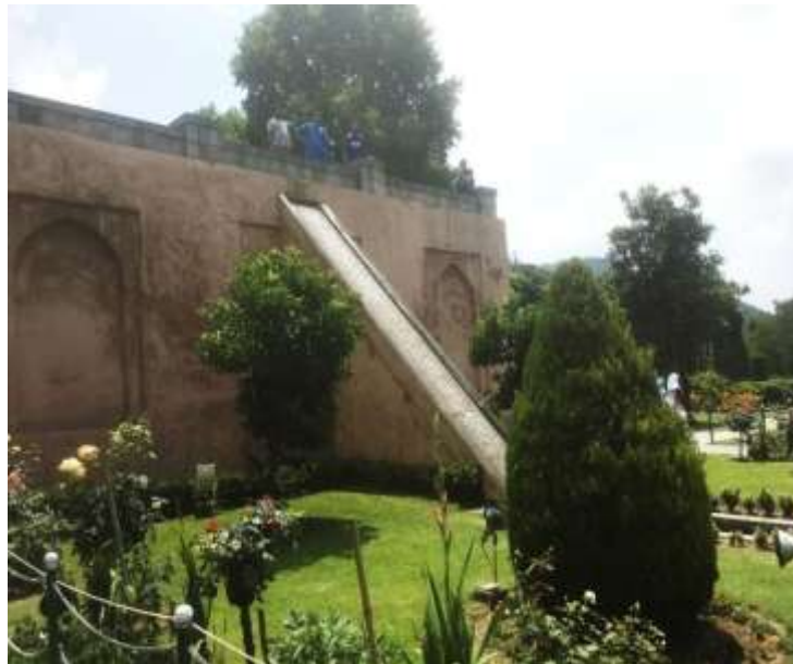
Plate 5: The image of the outer part of the PariMohal with its different types attractions.