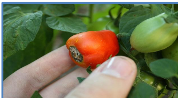
Calcium roots loss (blossom end rot) on a tomato