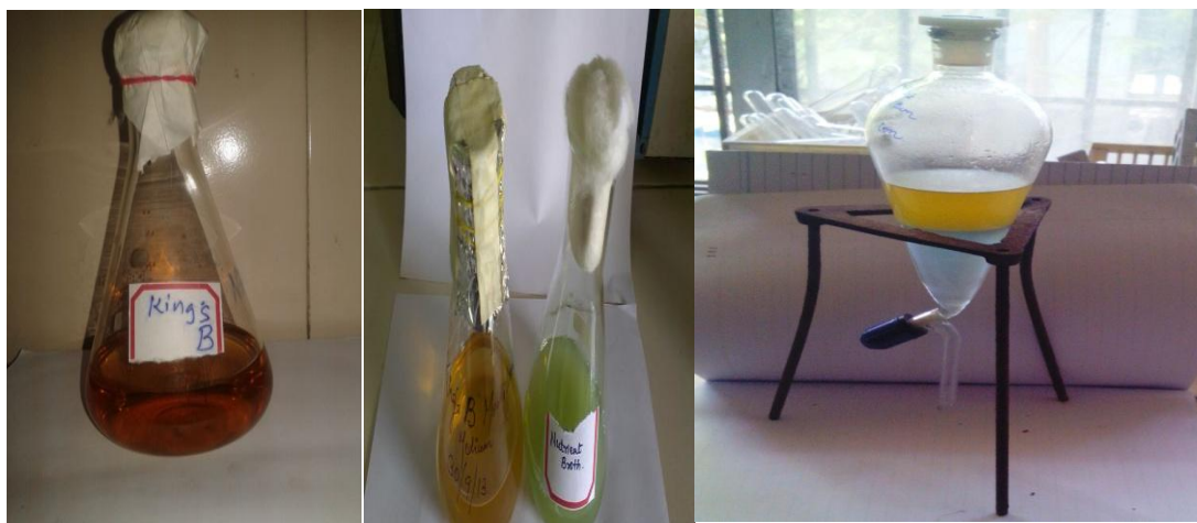
TABLE-1 EXTRACTION OF CRUDE PIGMENT BY CHLOROFORM SOLVENT