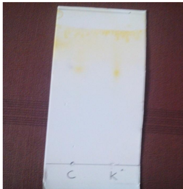
TABLE-2 showing the susceptibility of bacteria towards crude pigment