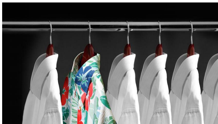
Fig 3: Overcoming impact of shorter attention span

Commercials that are shorter than 30-seconds are embedded with surprise value way before commercial-haters can do something about it, while those that last longer than 30 seconds are more towards story-telling in a bid to appeal to the consumer (Elliott, 2005). Thus, this could show how the industry tried their means and ways to get the message across to the consumer in order to address short attention span for an effective advertising communication.