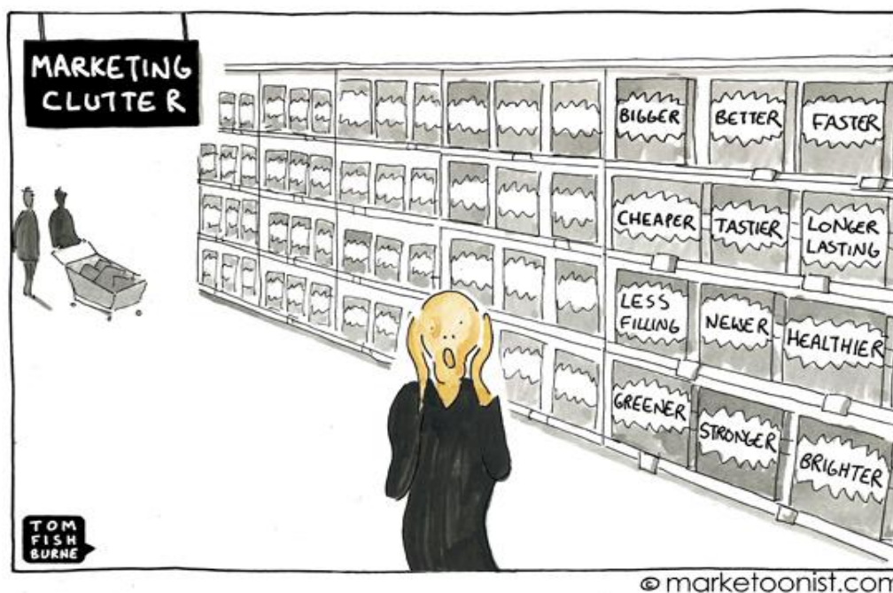
Fig 1: The rising Advertising clutter

So, is your marketing being seen? Or is it lost in the noise of advertising?