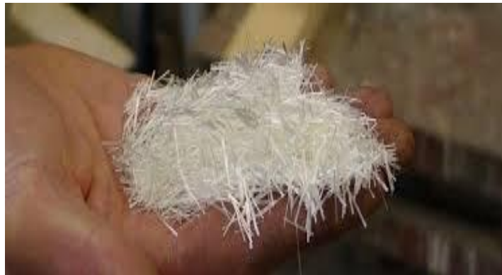
Figure:2.1 Glass fiber of size 7mm