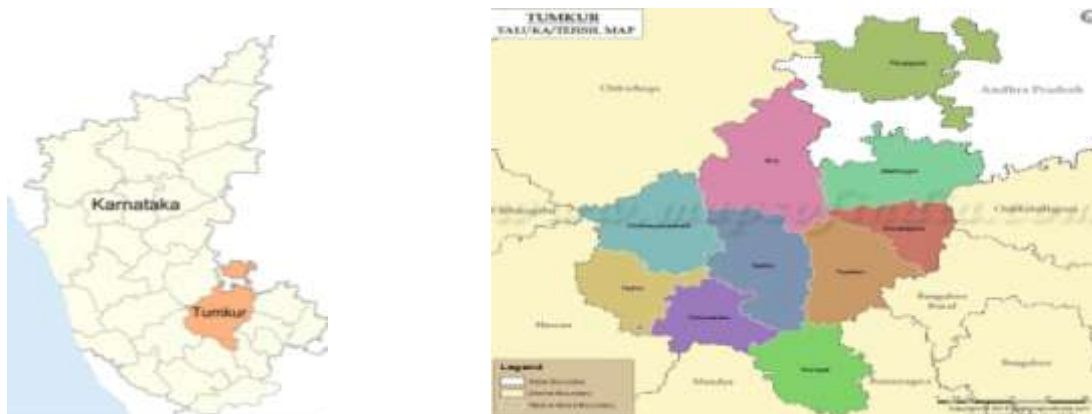
Figure-1: Map of Tumkur district in the state of Karnataka