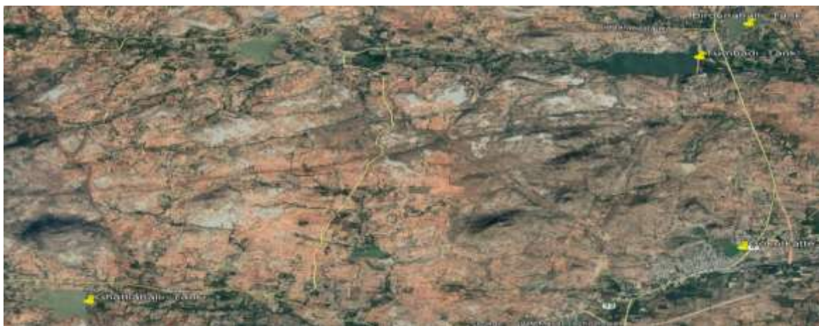
Figure-2: IRS Map of koratageri showing the Lakes studied